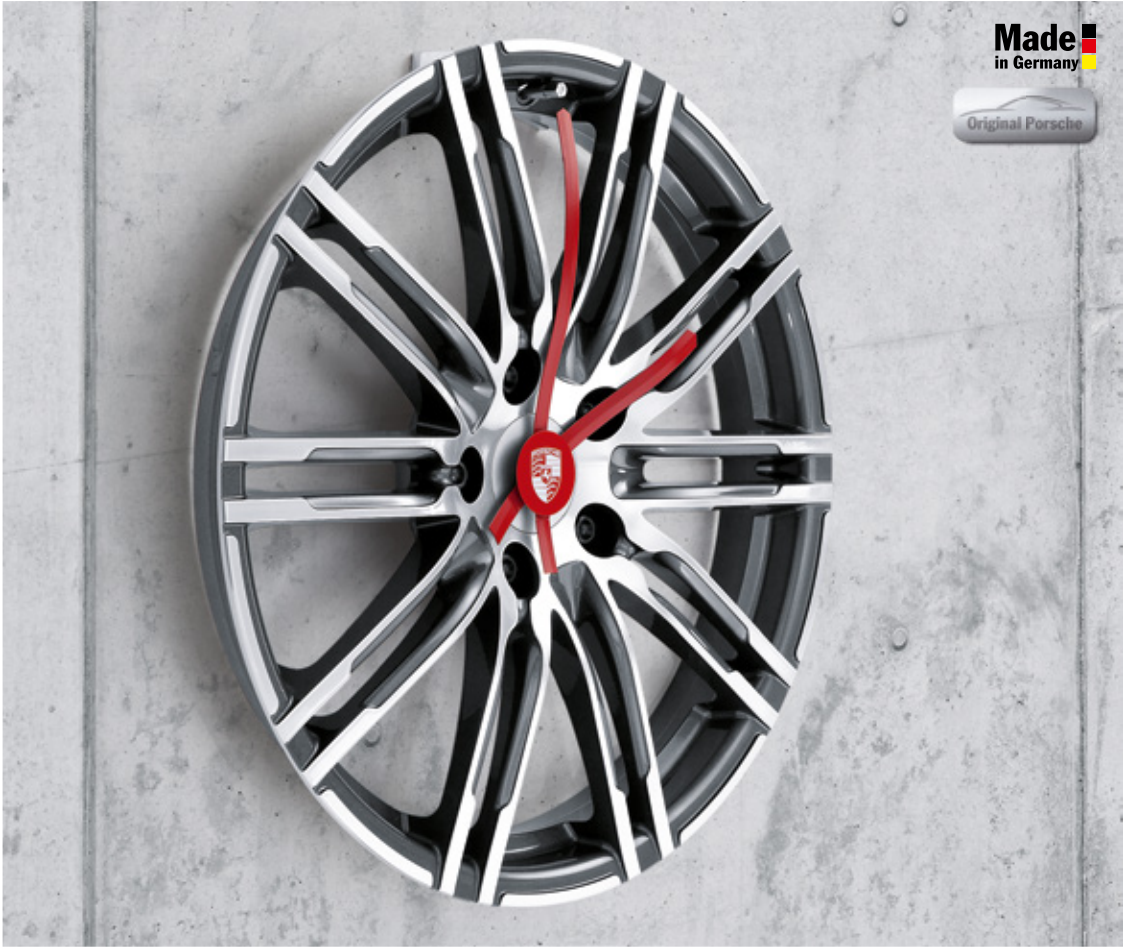
[1] Porsche 911 Turbo rim wall clock. This wheel rim clock is made from a 20" original rim as featured in the current 911 Turbo. Weight: approx. 8 kg. Made in Germany.